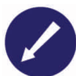
Compulsory Keep left