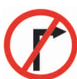
No Right Turn