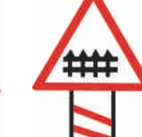
Guarded Rly Crossing