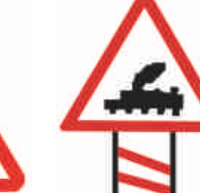
Unguarded Rly Crossing