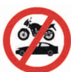
All Motor Vehicles Prohibited