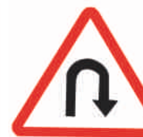
Right Hand Pin Bend