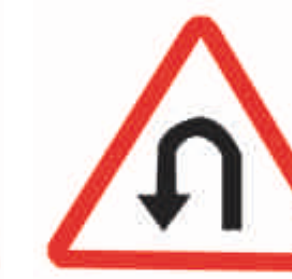
Left Hand Pin Bend