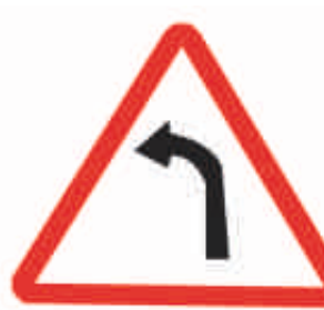
Left Hand Curve