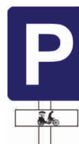
Cycle Rikshaw Stand