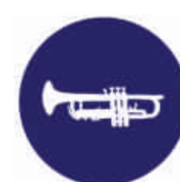
Compulsory Sound Horn