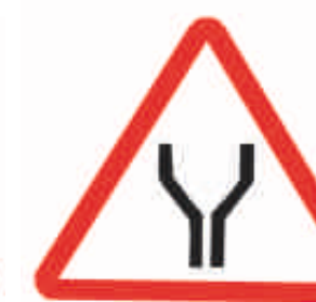
Road Widens Ahead