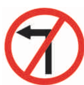
No Left Turn