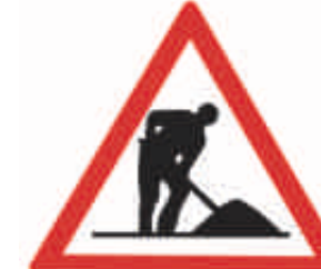
People at Work