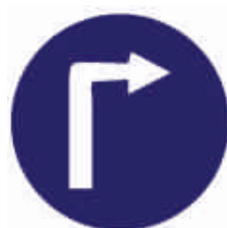
Compulsory Right Turn