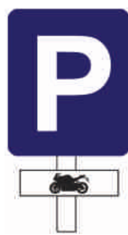
Scooter/ Motor Cycle Stand