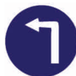
Compulsory Left Turn