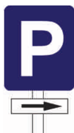
Parking This Side