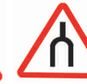
Narrow Road Ahead