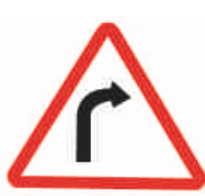
Right Hand Curve