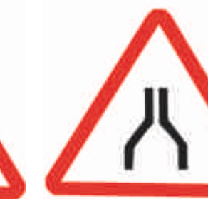
Dual Carriageway Ends